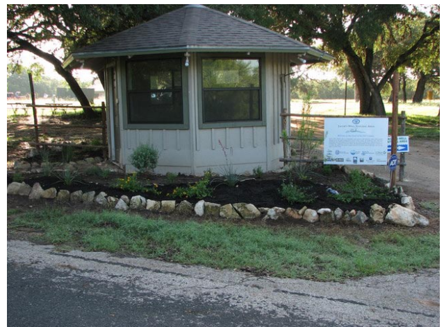
Native plant area at entrance.

The group has also been actively working on the Ashe Junipers. They've identified a primary area for thinning and removal of lower branches to promote the re-establishment of ground cover. Larger branches and saplings are being used for erosion control on slopes.