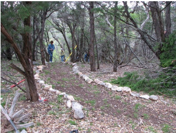
A new trail.

The team has also been constructing and maintaining trails to improve public access.