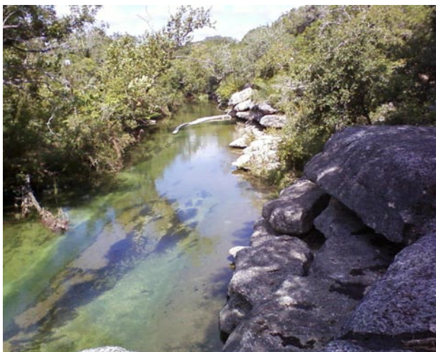
Jacob's Well after the flood. Most of the vegetation has been scoured away.