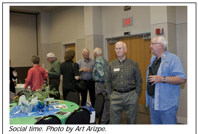
Social time.