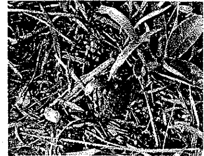
The seed balls sprouting in the containers at the Extension office.