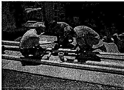
Curtis, Wayne and Tom working in 100 degree heat.

rainwater collection system. Take time to look at it at the meeting. We will use it to water